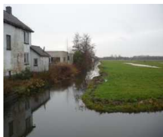
Figure 2: Water level critical