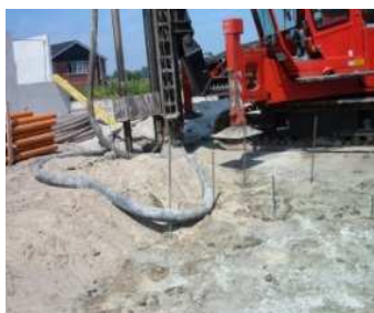
Figure 3: Construction of poles