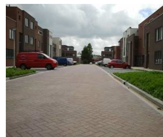
Figure 5: Final construction