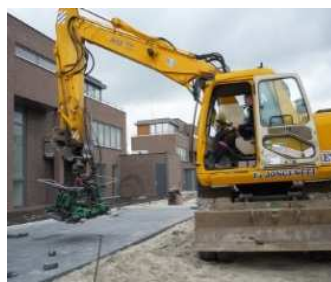
Figure 4: Work in progress