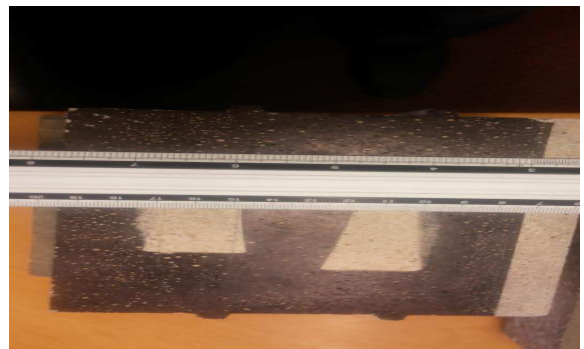
Figure 4: Wide wheel Abrasion Test