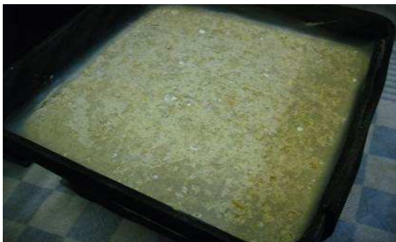
Figure 3: Freeze-Thaw Sample